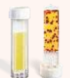
Total Bacterial Count (TBC)