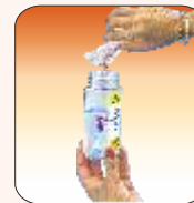
4. Pour pouch contents into bottle

5. Keep in a warm place for 18 to 24 hours (No Need for Incubator)