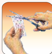
2. Cut open both the pouches carefully