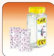
1. Media Pouches & sterile bottle