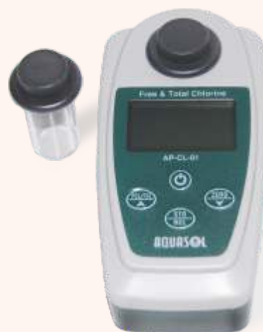
Free and Total Chlorine Meter