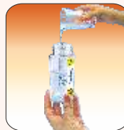
3. Pour water sample upto 100ml mark