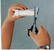
Cut open polybag