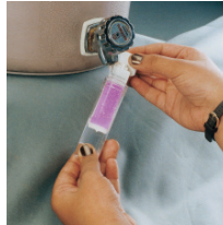
Or if a clean container is not available, the outer tube can be used to hold the material.