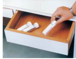
Incubate (in a warm place)