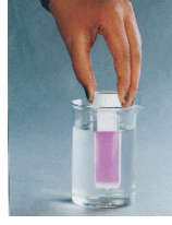
Dip for 20-25 seconds. Use a clean container to hold the test material